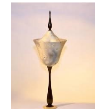
Goblet with spiral stem, lid and finial