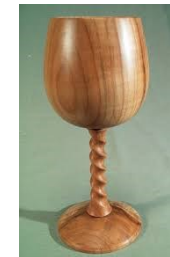
Goblet with spiral stem