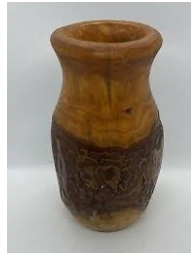
Vase with Rim