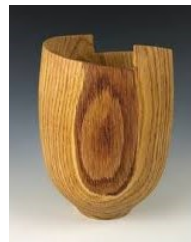
Vase with carved Rim