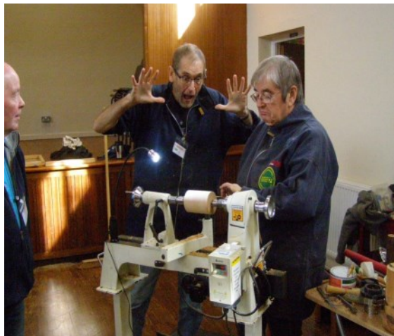
And he'd been soooo patient with me all day!